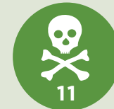
SWEET BELL PEPPERS