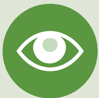
SKIN, EYE, AND LUNG IRRITATION

Because pesticides end up virtually everywhere instead of staying where they're supposed to, their existence in our environment has been linked to the following health problems: