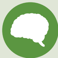
BRAIN AND NERVOUS SYSTEM TOXICITY

which can lead to early onset puberty as well as other health concerns